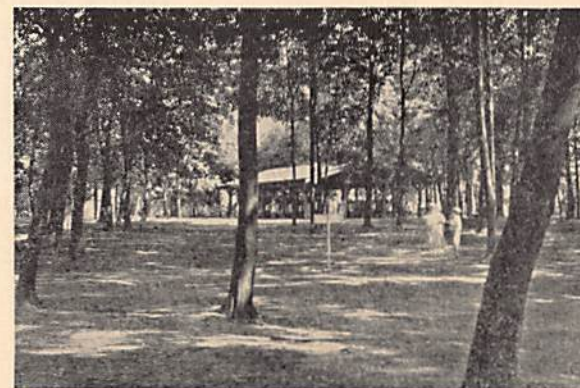
Where Ham Meets Ham